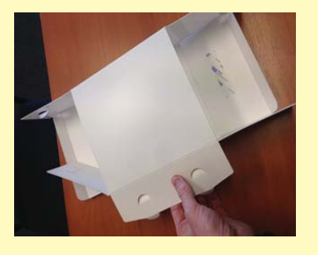
5 As shown in the image bring the opposite panels together ensuring the panel with the horizontal slits is on the inside.