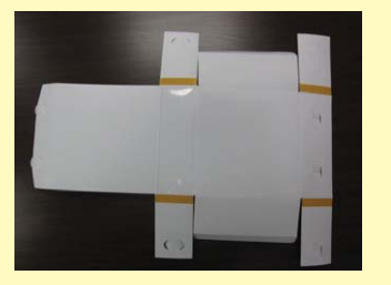
Lay the divider on the desk with the adhesive tape and clear plastic pouch facing up. Insert your laminated sign into the clear plastic pouch.

See our How 2 - Shelf Divider Stands video at http://goo.gl/3qZag