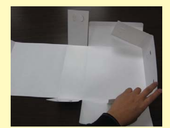
4 Bring in the far right panel into the middle holding it in place with your right hand.