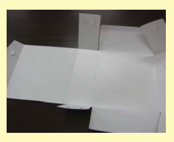
3 Fold in panels at their crease towards the centre of the divider. Lay all panels flat again.