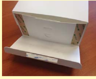
9 Finally, remove the backing tape on the remaining top panel and

insert the long tab in position closing the top of the divider. Press and hold tape positions for 20 secs. Repeat this step for the remaing bottom panel.