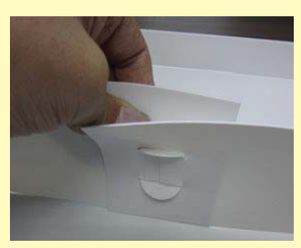
6 Remove backing tape, insert both semicircle tabs through the horizontal slits to secure the panels in place. Prefold the semicircle tabs to allow easy insertion. of the tabs.